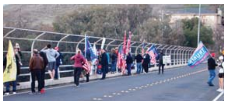
Trump supporters on the overpass Jan. 15.