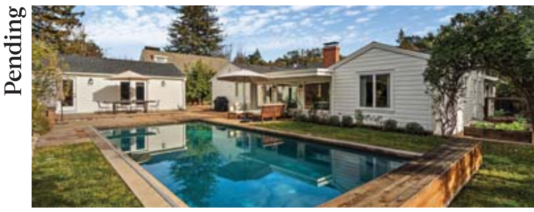
3976 S. Peardale Drive, Lafayette | Upper Happy Valley Neighborhood Listed at $2,295,000 | Pending with 8 offers 2,637 Sq. Ft. 💠 0.26 Acres 🛁 3 Baths

Considering selling your home? Now is the time to meet with us to start planning and preparing your home for sale in the spring. To maximize your home's value, we offer a program to cover the costs of home preparation to get your house ready to sell, at 0% interest rate and no fees.